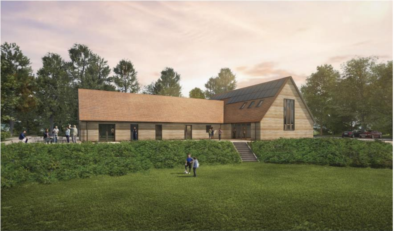
Figure 4 Proposed East Elevation