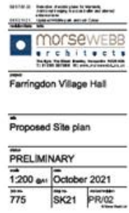
Figure 6 Proposed Site Plan